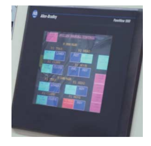
SCSExtrude coordinates the extrusion process, enabling communication among individual machines.

Although SCSExtrude is a standalone solution, we build in interfaces to third-party software systems, if desired. This allows for seamless interchanges of data. For example, a press schedule from a third-party software system can be downloaded to SCSExtrude with just a push of a button; then SCSExtrude collects the data about the actual run and sends it to the other system.