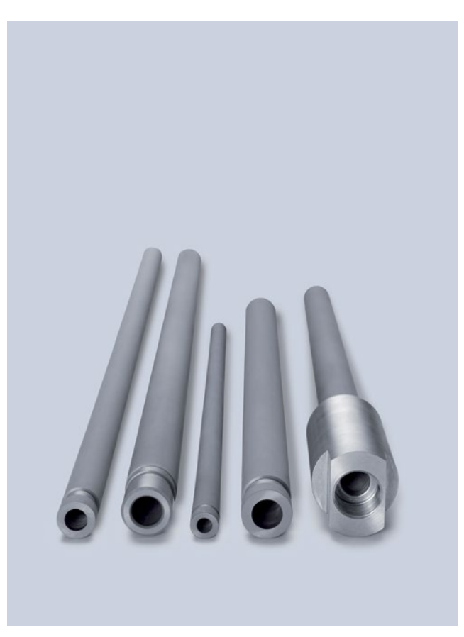
3M™ Silicon Nitride Thermocouple Protection Tubes in different designs

The most efficient material used for temperature measurement and control of aluminium and many non-ferrous alloys.