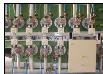
Upgrading of Furnaces