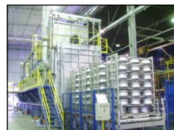
T6 Continuous Furnace