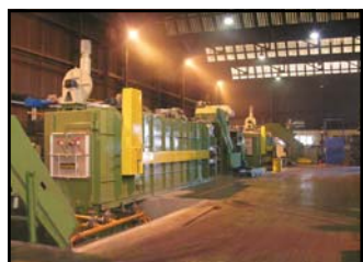
Hardening and Tempering Continuous Line